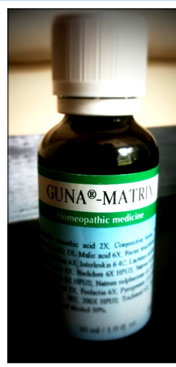
This is my very own bottle of Matrix ~ The cold, heartless pictures online didn't do it justice!

Matrix is one of several remedies recommended in Guna's detox protocol; Matrix's job is to clear out the "extracellular matrix," or the environment that